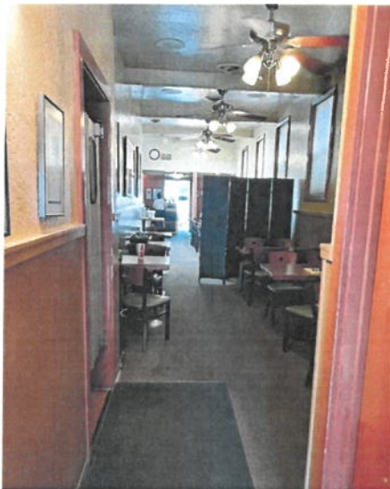
Los Gatos Café: Photos of Property for conditional use permit modification.