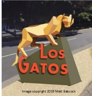
Proposal #1 by artist Matt Babcock